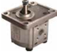
PLP 10 81/86-E1