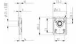
"E1" AVRUPA STANDARDI KAPAK TIPI